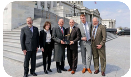
Presenting the Golden Spike Award to Representative DeFazio in Washington, D.C.