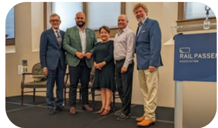
Mayors of Mississippi and our CEO celebrating passenger rail expansion

Rail corridors generate value by acting as economic engines in the communities they serve - through jobs, retail, mobility, tourism, and real-estate development. The Association conducts research into the economic, social, civic, and public policy impacts of passenger and commuter rail for communities of all sizes.