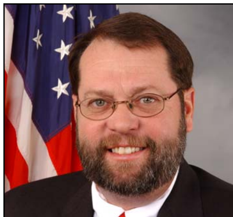
Representative Steve LaTourette (R-OH)